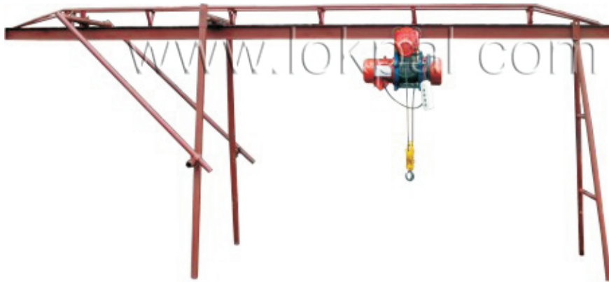
Mini Lift (Channel Type)