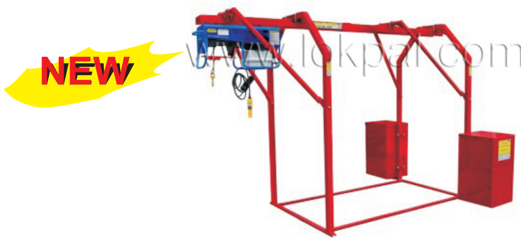
Mini Lift (Counter Weight Type)